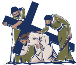
HOLY WEEK SCHEDULE

Every Easter, we gather and tell the story of Jesus' resurrection from the dead. We feel the same wonder, surprise and joy that was felt by those who actually witnessed it. Come and join us during Holy Week, as we share the solemnity of the upper room, feel the darkness of the tomb and then proclaim the wonderful news that “Christ has risen!” Let this experience remind us that God is always doing wonderful and surprising things that are more than we can ever understand.