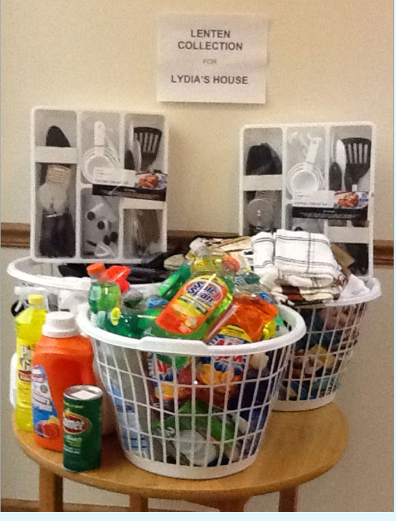
OUR BASKETS OVERFLOWTH... As usual, you were very generous and it was much appreciated by Lydia's House residents. Thank you so much!

The items will be used by families currently living in Lydia's House apartments, and will be offered to residents as they leave for independent living.